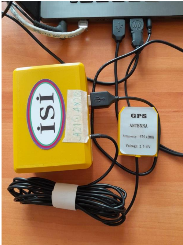
Figure 3. Hardware unit containing the MPU-6050 sensor module

In this section, the results of the computational experiments are outlined and analyzed. For the experiments, we have built a hardware unit (Fig. 3) containing the MPU-6050 sensor module inside and a GPS module that can connect to an external GPS antenna. The GPS in the hardware unit is designed to be used during intensive movement and was not used in this experiment.